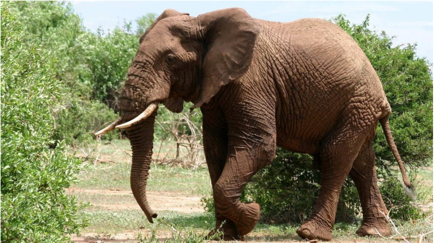
Image 1. An African elephant in Tanzania. A new study explains how African elephants ended up with such wrinkly skin.

African elephants have wrinkled skin. Scientists know that elephants have the wrinkles to stay cool.